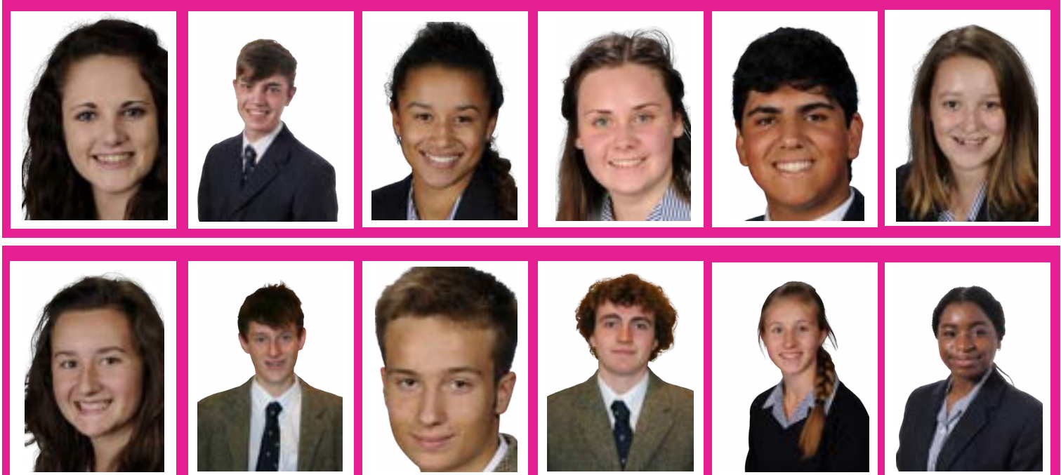
Bourne Academy students who have secured full bursaries at Canford Sixth Form