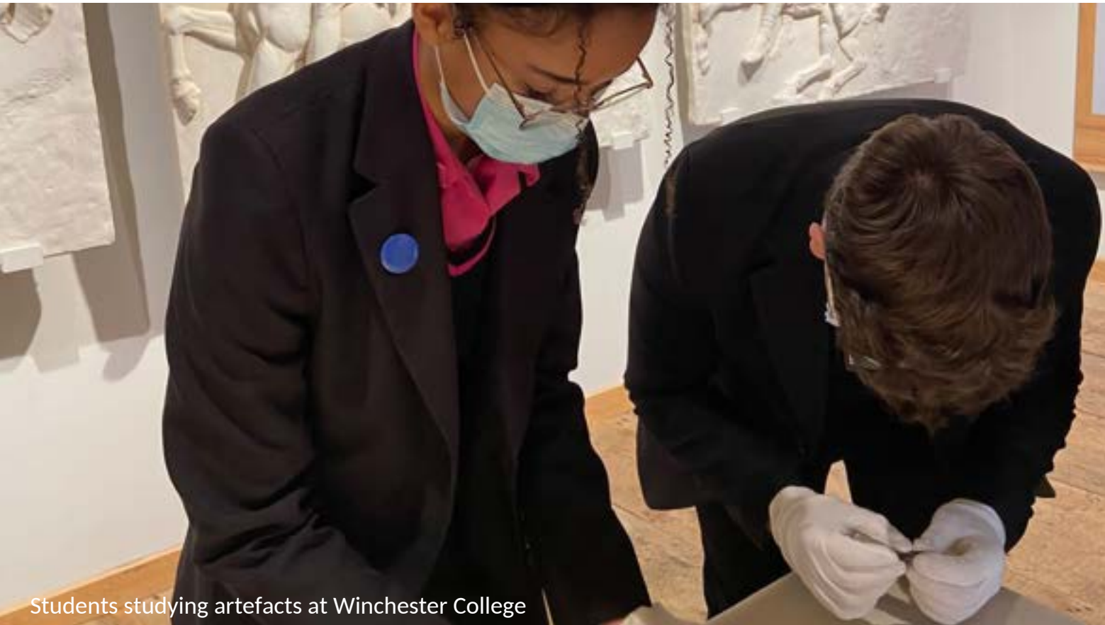
Students studying artefacts at Winchester College

The Bourne Scholars Programme consists of students who rank in the top 15% of their respective year group, and who commit to participate in the 'academic' and 'extra-curricular' strands of the Programme. Bourne Scholars not only rate highly within the top academic rankings, but they also strive to develop their all-round Character, as epitomised in the Bourne Scholars motto 'Aspire, Believe, Achieve'.