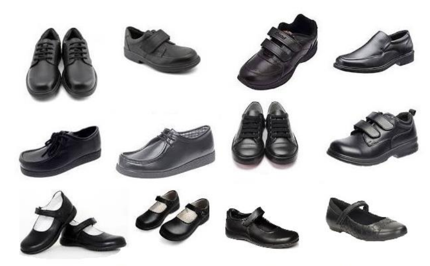
Examples of shoes - However, any leather type shoes are acceptable

Shoes must be leather/leather look shoes.