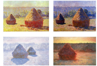
Examples of Monet's original Haystack Paintings

Last term our Year 7 students learnt about colour theory. We looked at Impressionism and the work of Claude Monet and in particular, his series of haystack paintings. Monet tried to capture the same field of haystacks at different times of day, during different weather conditions and during different seasons. The students task was to try to communicate both the beautiful effects of light that Monet captures, the short brush strokes and also the subtle blends of many colours he observes. Here's a few examples of the fantastic work they produced: