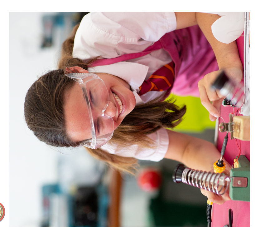
Steps to ASPIRE Independence