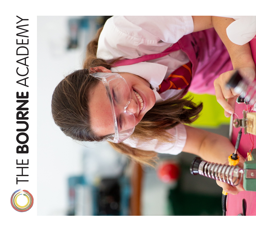
Steps to ASPIRE Independence