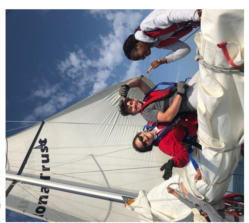
Steps to ASPIRE Ambitious