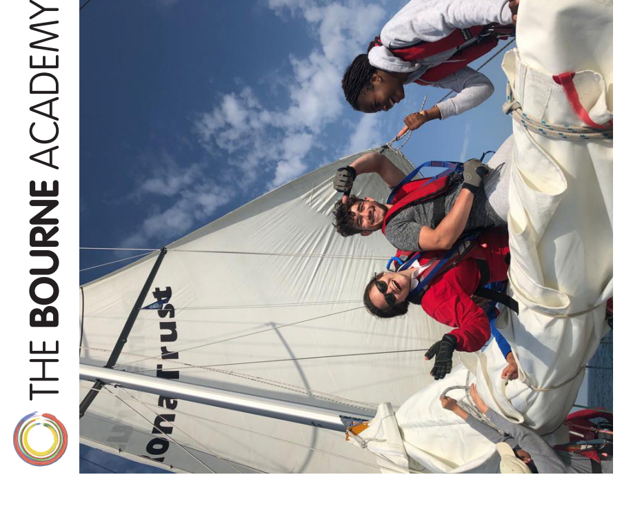
Steps to ASPIRE Ambitious