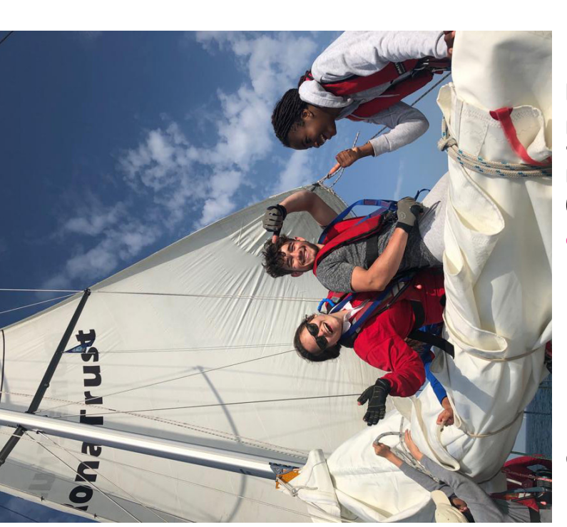
Steps to ASPIRE Ambitious