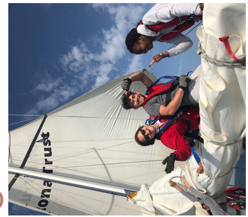
Steps to ASPIRE Ambitious