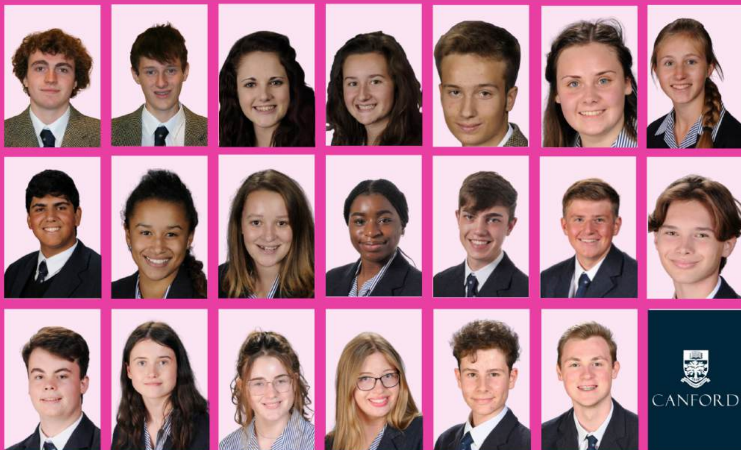
Bourne Academy students who have secured bursaries to Canford Sixth Form