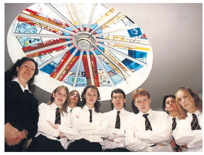
■ Kingsleigh Secondary School eight-foot diameter stained glass dome created by pupils and the artist Sasha Ward in 1995